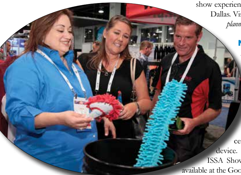
Chemical Co. – Booth 6231.

Also this year, in addition to the popular Residential Pavilion, International Pavilion and the First-Time Exhibitors Pavilion – which features more than 75 manufacturers – ISSA has added a Pressure-Washing Pavilion for this niche market as well as a Start-up Pavilion for those with new and stimulating ideas. With so much to see and do, don’t forget to take a break and enjoy a cold beverage at the ISSA Sports Bar, sponsored by Spartan